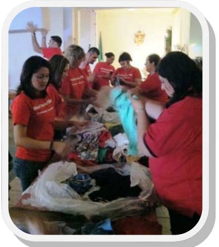
Bank of America Volunteers

◆ Recently, local Bank of America Branch Managers volunteered with Arrowhead United Way at the Central City Lutheran Mission (CCLM) in San Bernardino. Volunteers prepared clothes for the Mission's resale store in a little over an hour; one CCLM employee indicated that it would have taken them a week to sort and organize all the items. The volunteers also spent time with the students that attend the Mission's after school program. Volunteers then offered 2 hours of one on one tutoring and homework assistance and finished the day by organizing supplies for the after school program.