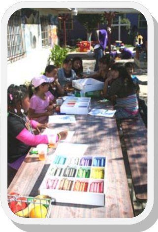
Make A Difference Day

◆ Arrowhead United Way partnered with Central City Lutheran Mission in San Bernardino for 'Make A Difference Day' in order to renovate classrooms for the Mission's after school program. Members and volunteers painted every classroom and planted flowers and fruit trees donated from Serrano Nursery in Colton. The organization also created new academic based playground games for students to encourage and support physical play and activity. The event drew in over 75 volunteers who participated in the event. Volunteer teams from Fed Ex Rialto, the California Conservation Corps, along with Well's Fargo Home Mortgage lent a genuine hand to the much needed repairs. Starbucks, Costco and Pizza Hut donated breakfast and lunch for all the volunteers participating in the event. During lunch The San Bernardino Teen Music Workshop group performed for all the volunteers. ITT Tech even donated classroom furnishings to aid in the renovations. Students in the Mission's after school program also came out to help reinvent their new classrooms.