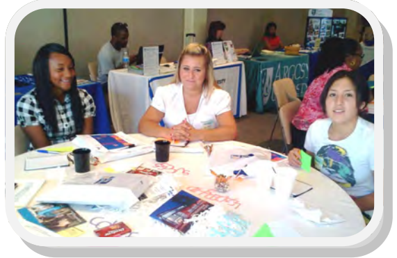
College Cruise participants

◆ The Women's Leadership Council of Arrowhead United Way recently hosted female high school juniors and seniors for a fun half-day of workshops designed to assist them in determining a career path, sorting through resources, and improving skills in time management, overcoming obstacles, and goal-setting at California State University San Bernardino. The goal of the program, Summer College Cruise: Navigating the Waters of Education to a Successful Future, was to provide an introduction to the college experience for at-risk young women who may not be considering a secondary education, and to inspire them to consider a variety of career and educational options. The participants were treated to a tour of the campus and provided lunch. Thank you, California State University San Bernardino, Admissions & Student Recruitment and Educational Opportunity Program (EOP) for co-sponsoring this event.