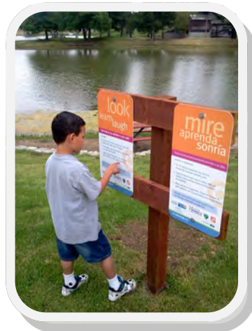
Born Learning Trail Glen Helen Regional Park

A 2009 study from the National Center for Education Statistics found that children living in poverty are less likely to have someone read to them, tell them stories, or sing to them. Additionally, research indicates that disadvantaged children come into school years behind their peers in pre-literacy skills and rarely catch up. Arrowhead United Way wants to change these statistics.