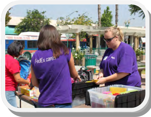
Volunteers sort donations